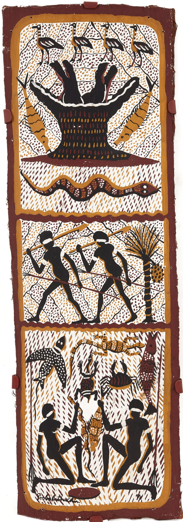
Dick Roughsey Taboo food story nd natural ochre on eucalyptus bark, 77 x 26 cm © Dick Roughsey Goobalathaldin/ Copyright Agency, 2022