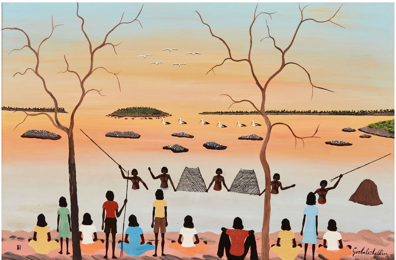
Below Dick Roughsey Hunters returning 1981 acrylic on board, 61 x 91 cm © Dick Roughsey Goobalathaldin/ Copyright Agency, 2022