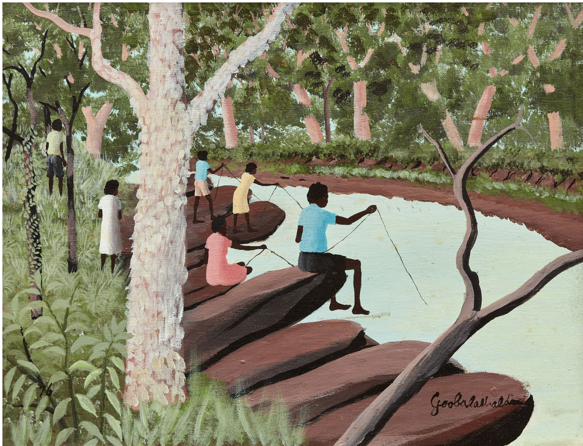
Above Dick Roughsey Fishing party 1976 acrylic on board, 35.5 x 45.5 cm © Dick Roughsey Goobalathaldin/ Copyright Agency, 2022