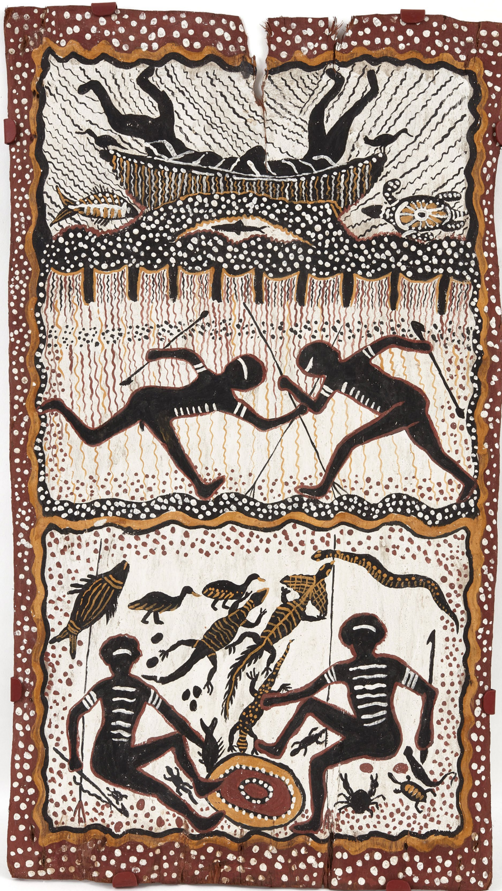
Attributed to Arnold Watt The story of the two Lurugu boys 1965 natural ochres and charcoal on eucalyptus bark, 73 x 41 cm © Arnold Watt