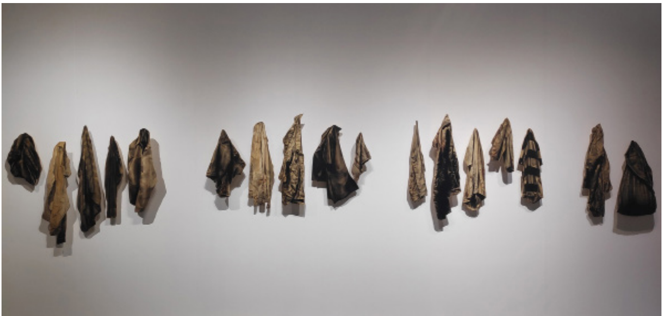
Below: Maharani Mancanagara Unjustified Justify: amicus curiae #1 2019 charcoal on shaped wood 150 x 700 x 15 cm (configuration)