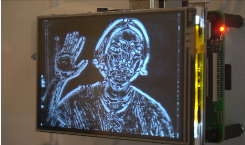
Left: Eldwin Pradipta Who Watches the Watchers #2 (still) 2020 3.5-inch LCD screen, camera, acrylic ed. of 4 +1 AP 15 x 20 x 6 cm