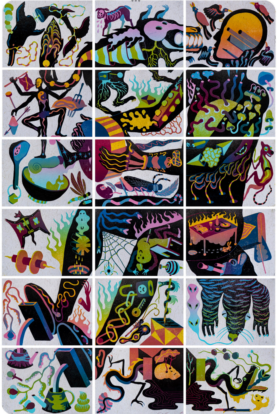
Agugn Prabowo Human Supremacy II 2020 linocut reproduction on handmade paper 119 x 77 cm ed. 2 of 3