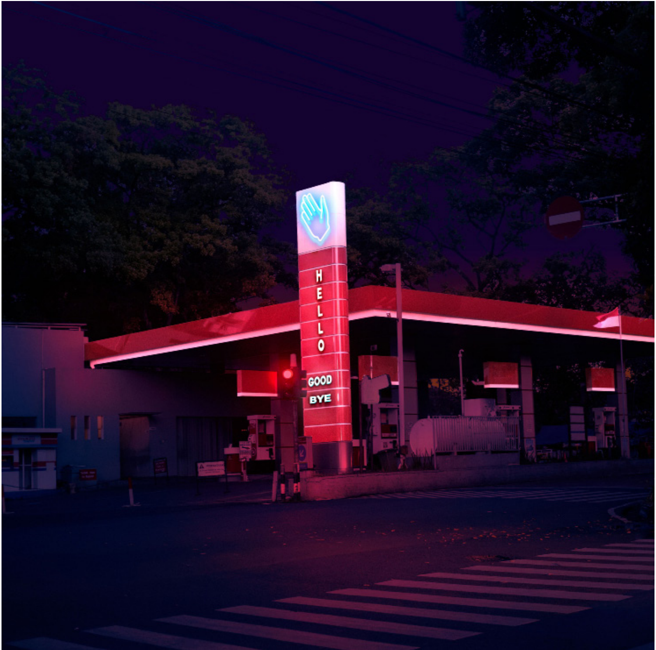
Meicy Sitorius Jurang 2020 inkjet print on Galerie Smooth Pearl paper 90 x 90 cm