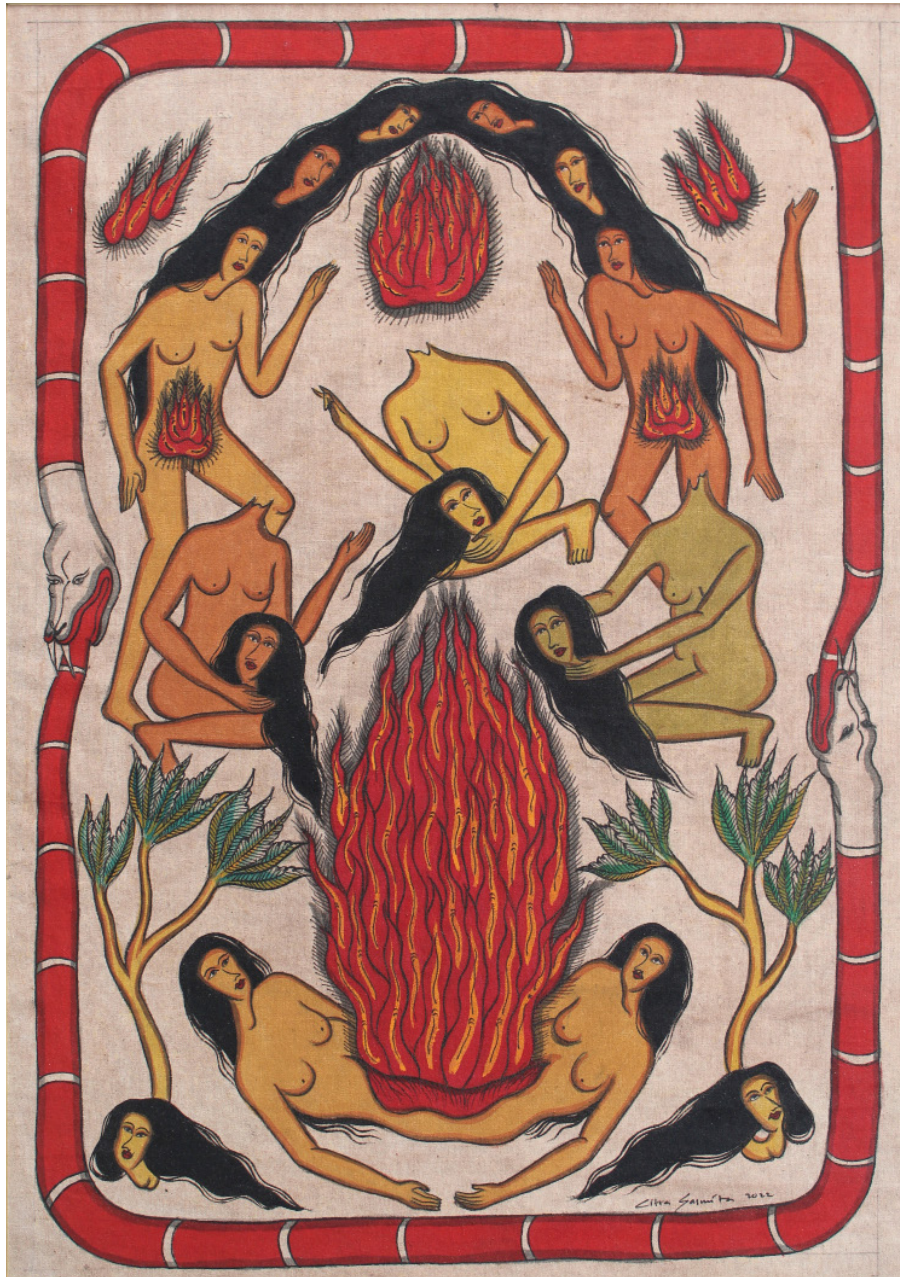
Citra Sasmita Rite of Passage 2022 acrylic on Kamasan traditional canvas 57 x 40.5 cm