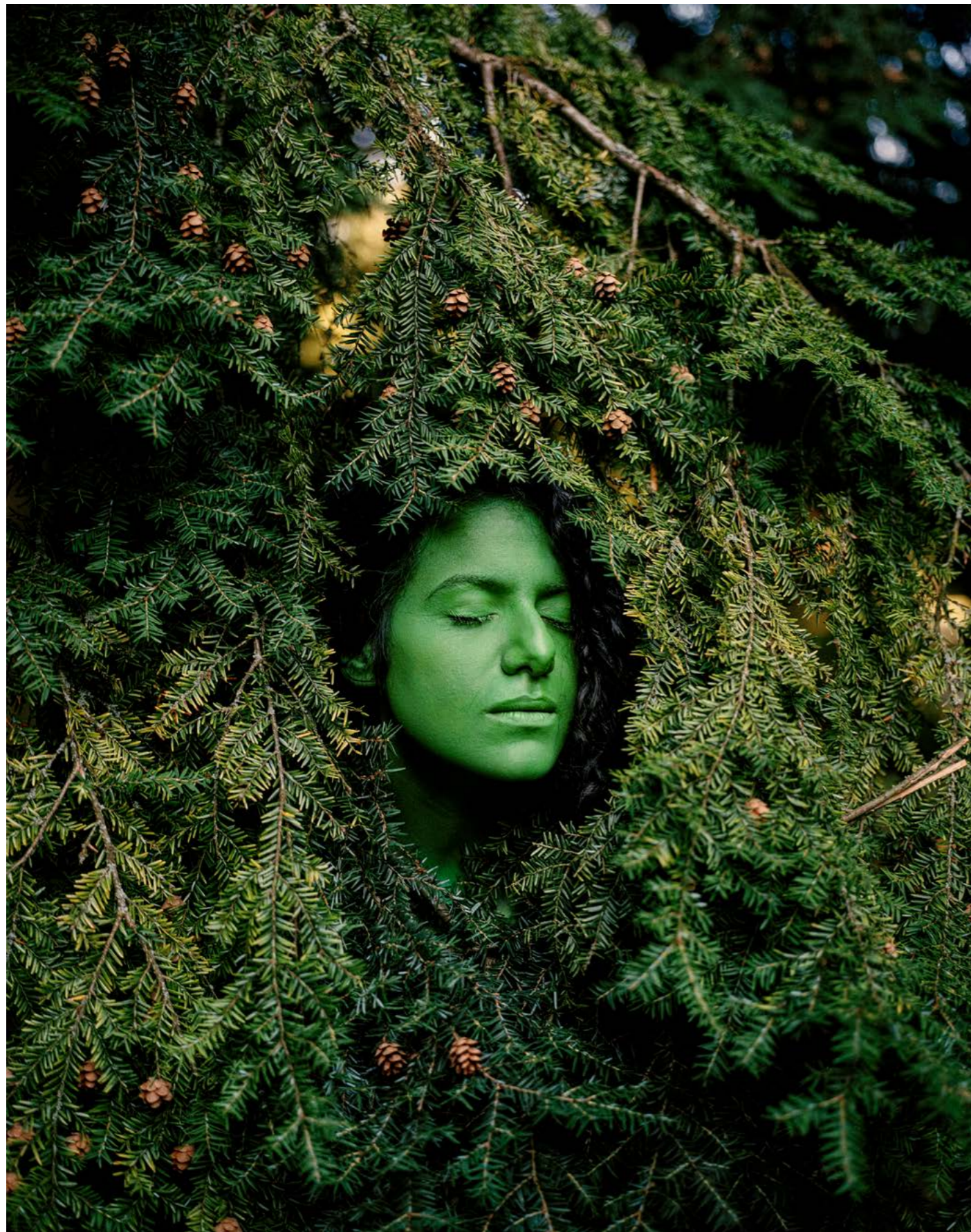
Shoufay Derz, Loving the alien, Bhitai: closed 2023, pigment print on cotton paper, 91.1 x 71.6 cm