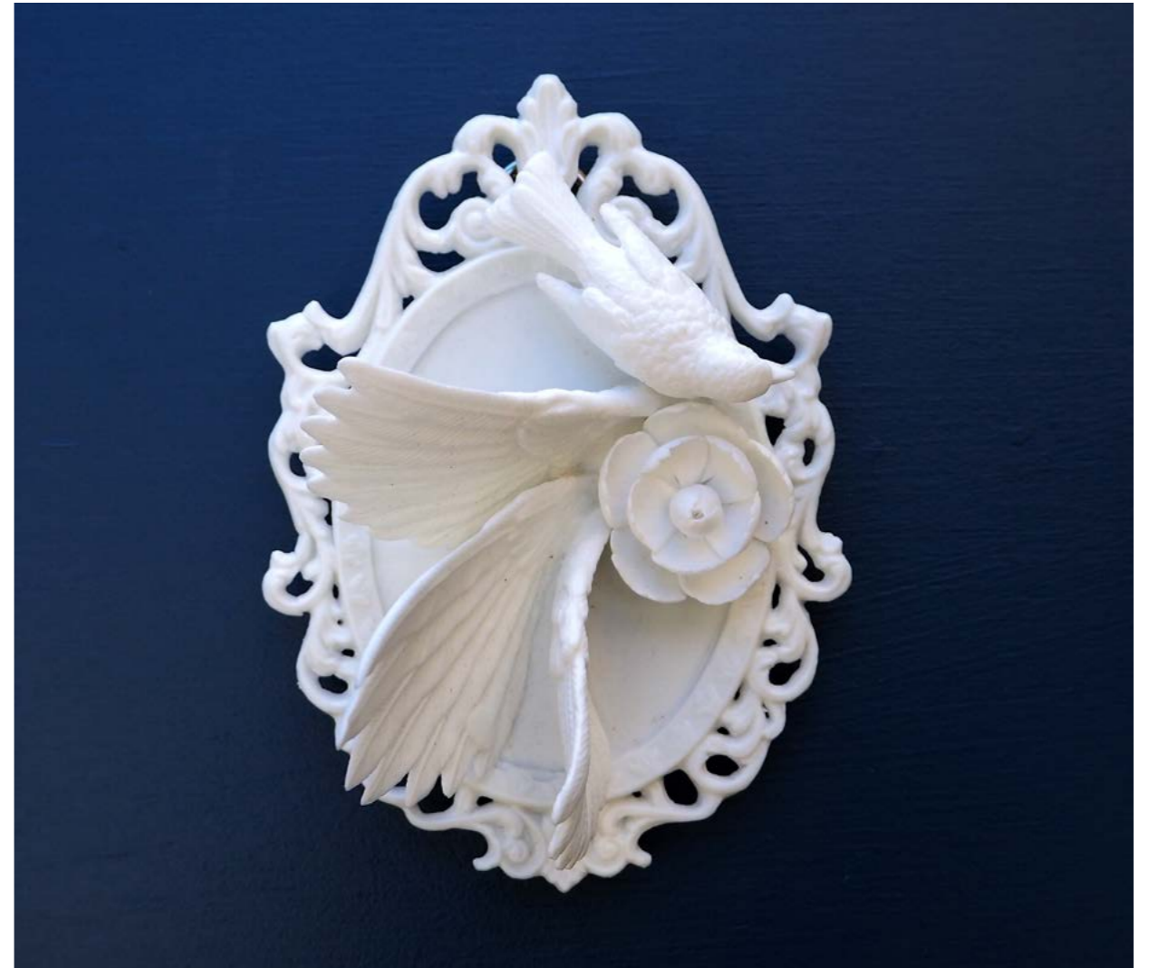
Ruth Ju-Shih Li, Self portrait 1 2019, Jingdezhen porcelain, 12 x 10 x 5 cm