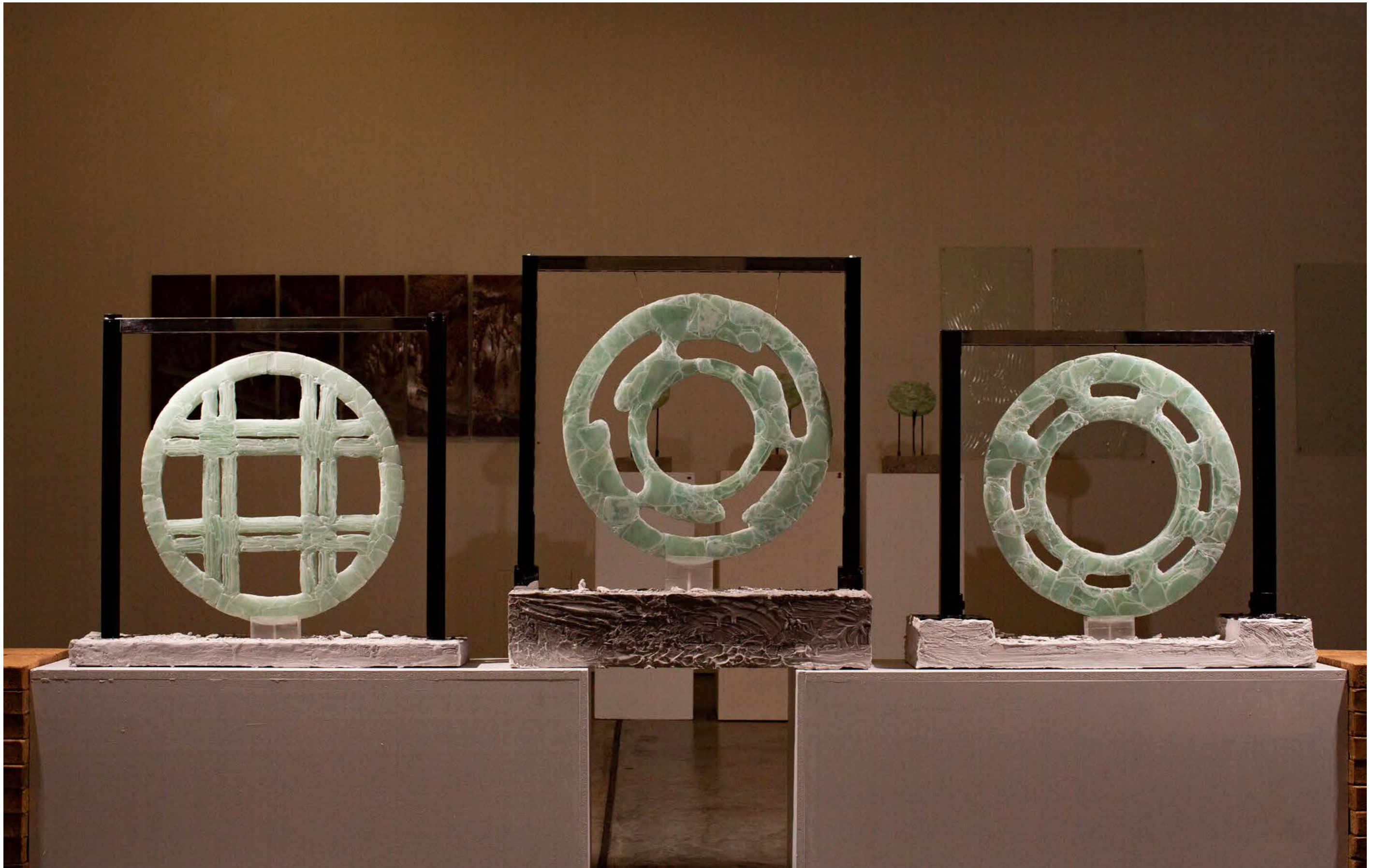
NC Qin, Moongate 1 2022, cast recycled glass, steel, perspex, wood, plaster, 73 x 85 x 21 cm Moongate 2 2022, cast recycled glass, steel, perspex, wood, plaster, 89 x 76 x 21 cm Moongate 3 2022, cast recycled glass, steel, perspex, wood, plaster, 76 x 83 x 20 cm Installation view at Art Atrium Gallery