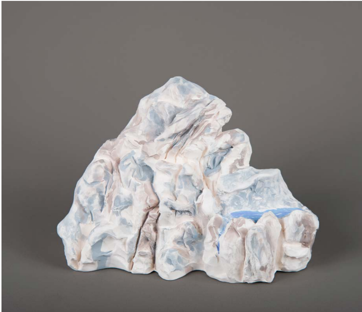
Jessica Bradford, Haw par villa rock study #25 2018, 12.5 x 18 x 8 cm, bisque fired underglazed porcelain