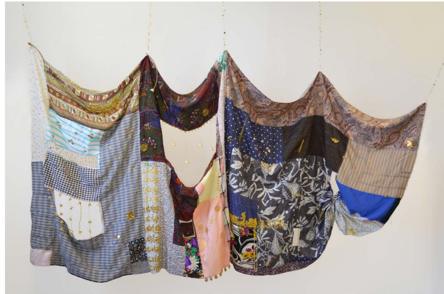
Linda Sok, Mending fragments of a memory 2021, fabric (assorted), metal trinkets, string, rattan, paint, dimensions variable